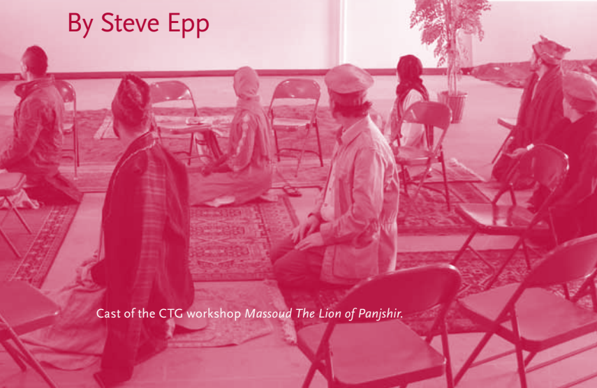
Cast of the CTG workshop Massoud The Lion of Panjshir .