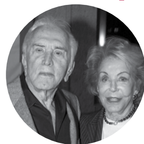
Kirk and Anne Douglas

"Theatre was always my first love," says Kirk Douglas.