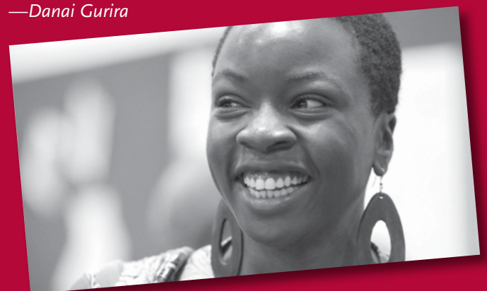
Danai Gurira