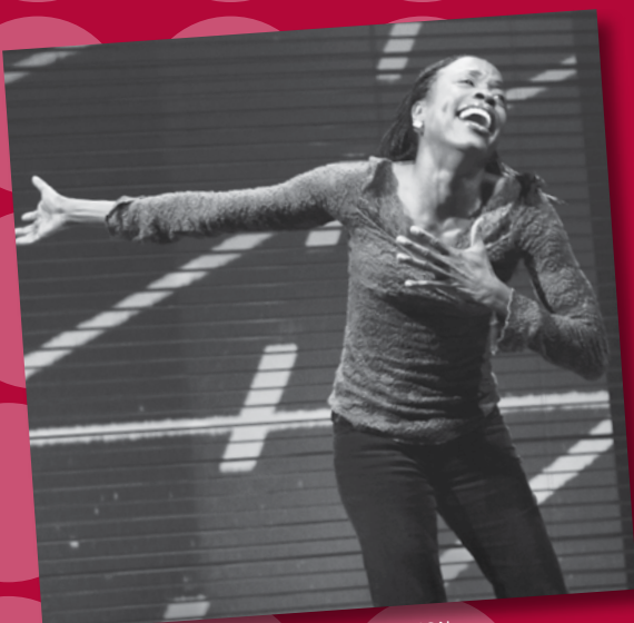
Charlayne Woodard

THIS PAST SUMMER the New Play Production team gathered two of our favorite artists, Danai Gurira and Charlayne Woodard, to talk about their fascinating and inspiring journeys. Both women have work featured in our upcoming Douglas season.