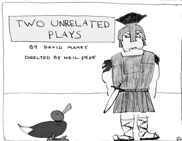
ILLUSTRATION BY DAVID MAMET.