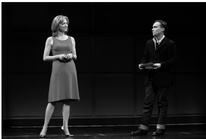
Julie White and Johnny Galecki.