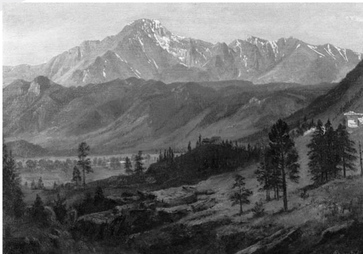
Pikes Peak, Albert Bierstadt