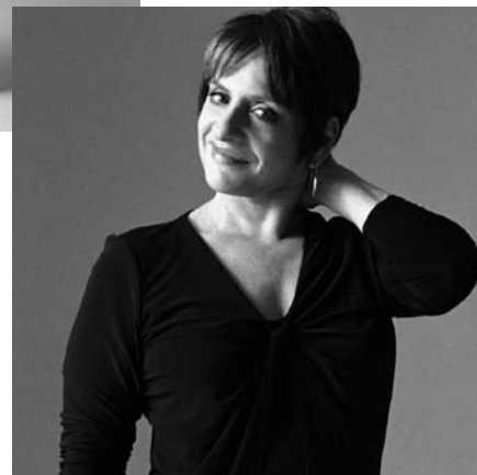
Patti LuPone and Mandy Patinkin.