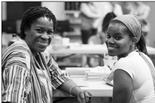
L TO R: Michael Hyatt and Kelly M. Jenrette