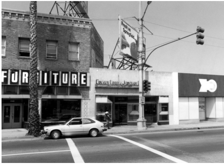
Culver City, Culver Blvd. 1977.