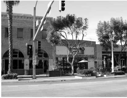
Culver City, Culver Blvd. today.

The city's Redevelopment Agency traces the beginning of Culver City's turnaround back to 1971. The conversion of the Culver Theater movie house into the Kirk Douglas Theatre, opening in 2004, was a key moment in the current cultural renaissance. A couple of years later, the Actors' Gang beat out several other theatre companies for the right to produce plays at the Ivy Substation (after a brief CTG residency and refurbishing) at the other end of Washington Boulevard. Restaurants that had been open exclusively for breakfast and lunch began keeping evening hours, and new eateries entered the scene along with a movie multiplex which opened in the city's Town Plaza. Culver City's Main Street may be tiny, but empty it ain't.